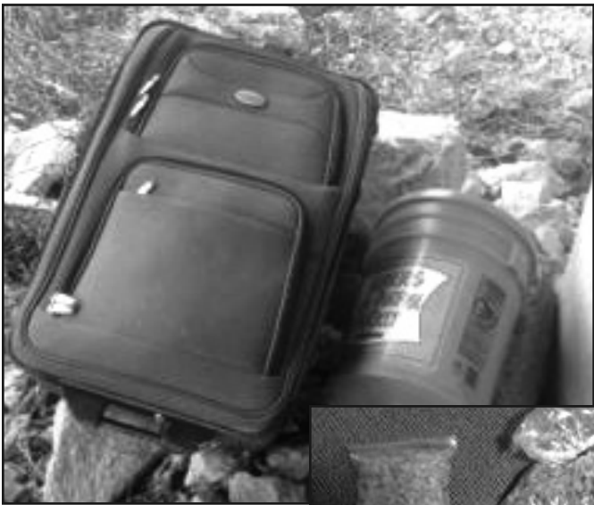
The green suitcase and the red container found by highway workers, and (at right) the 15 pounds of marijuana inside the suitcase.